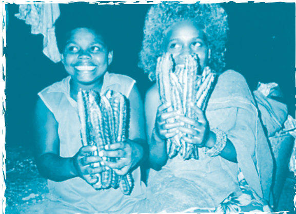
Girls with the seed pod of winged bean